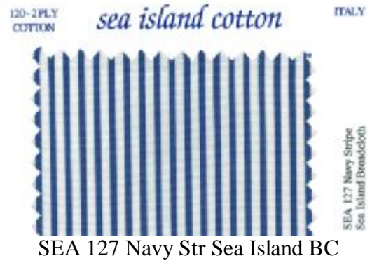
SEA 127 Navy Str Sea Island BC