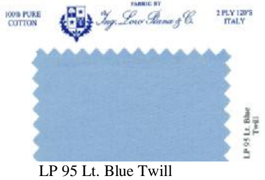
LP 95 Lt. Blue Twill